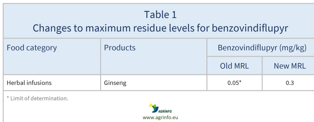
Table & Figures