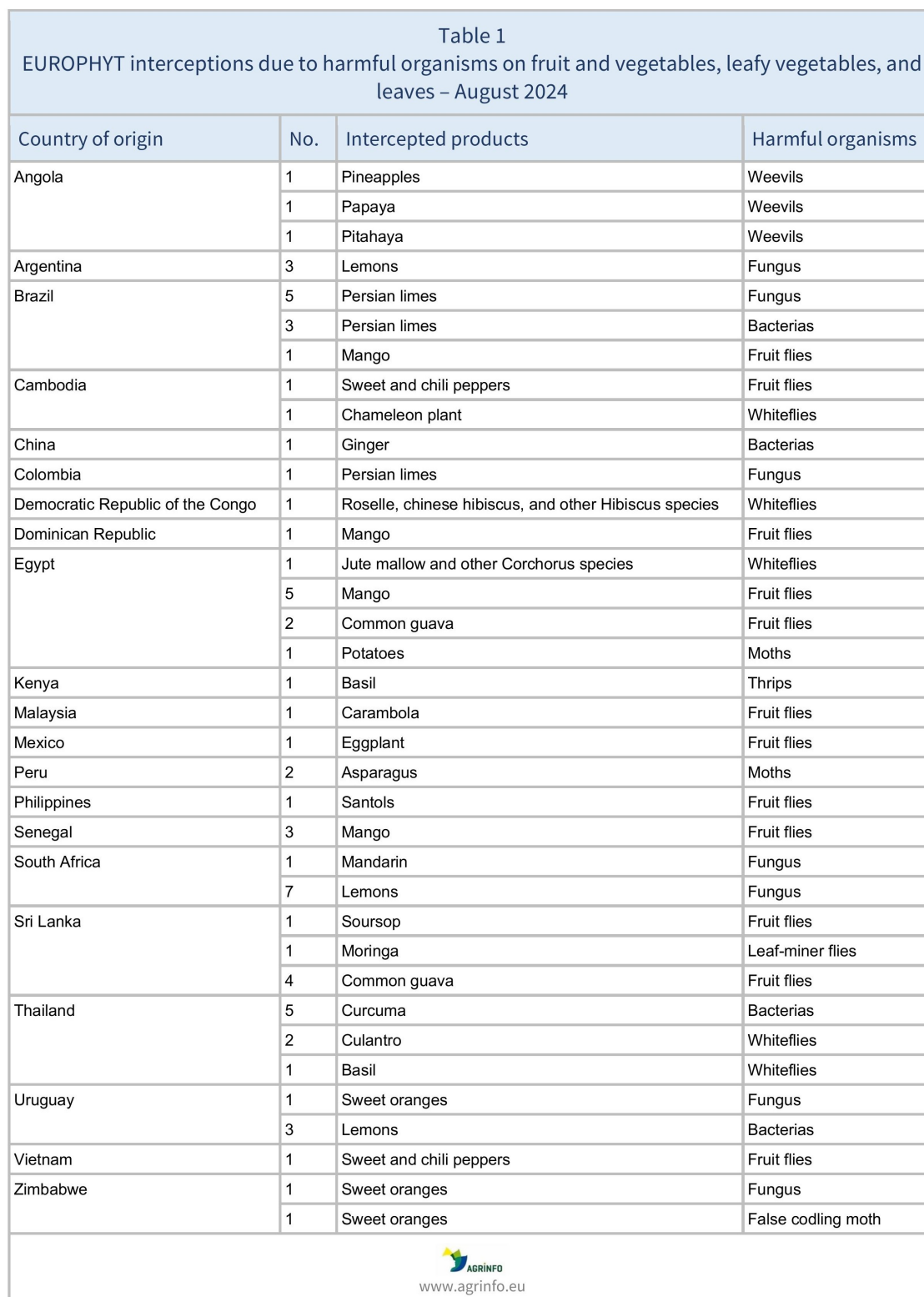
Table & Figures