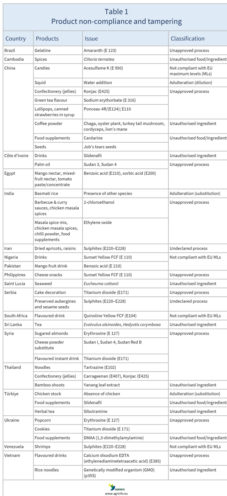
Table & Figures