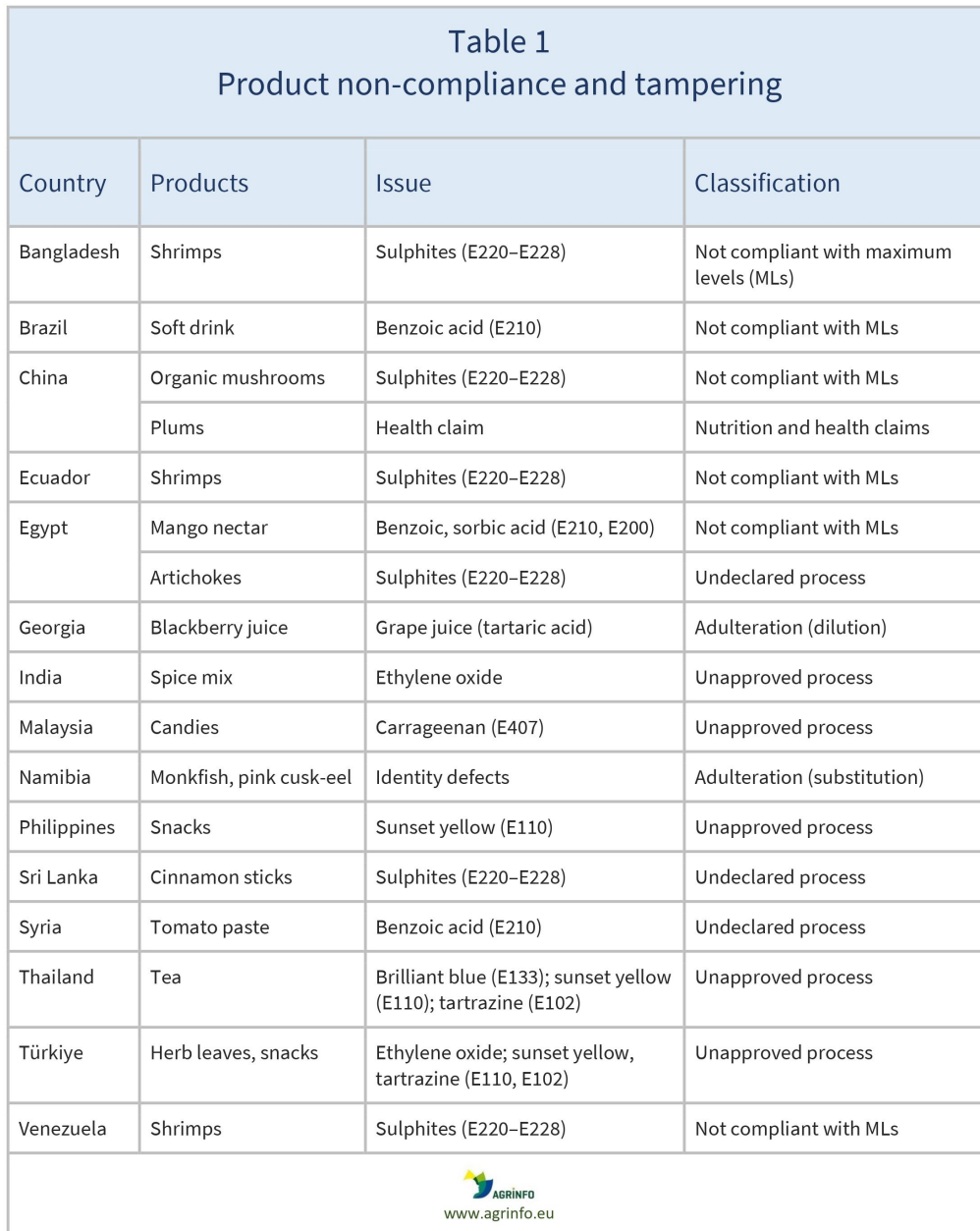
Table & Figures