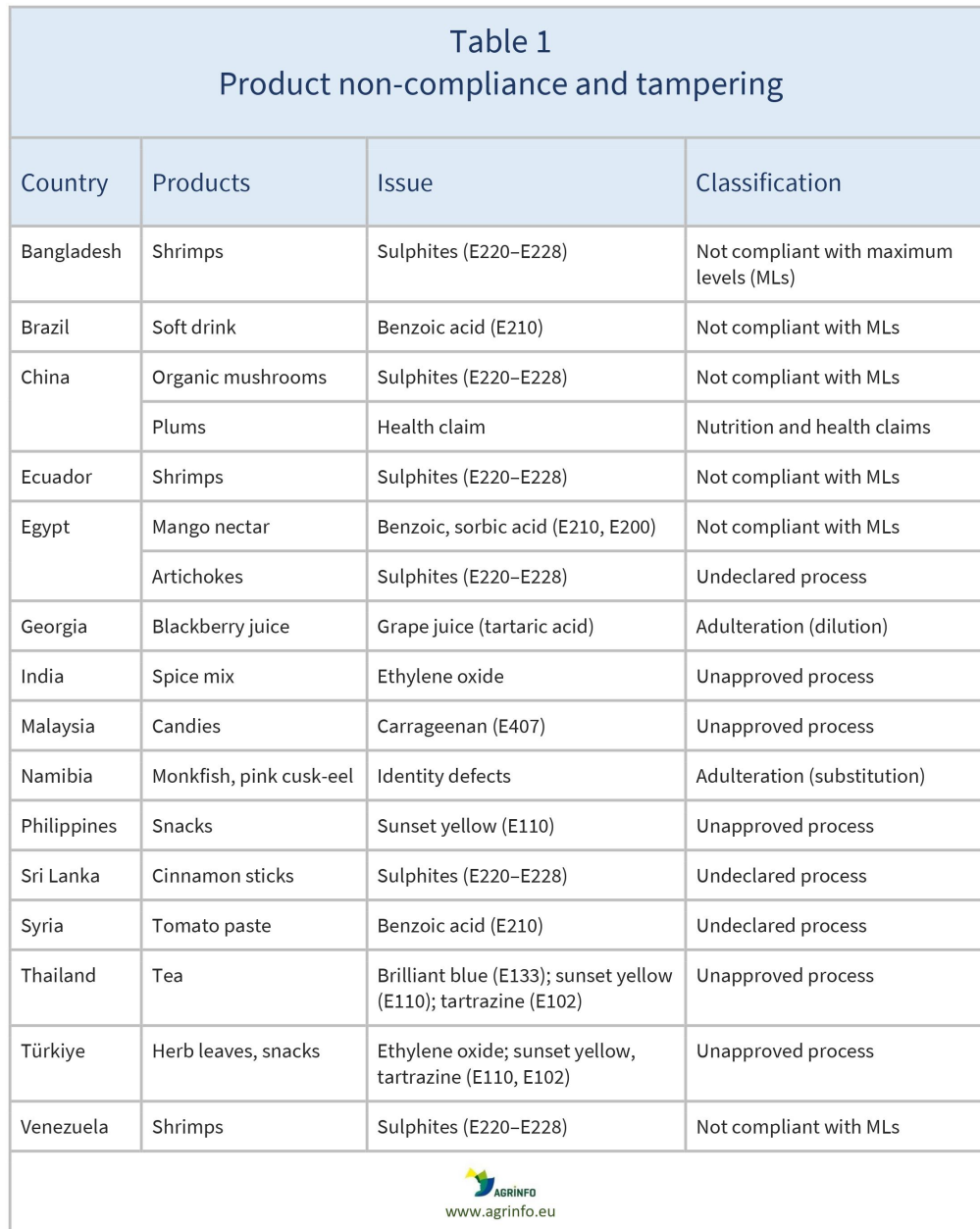
Table & Figures