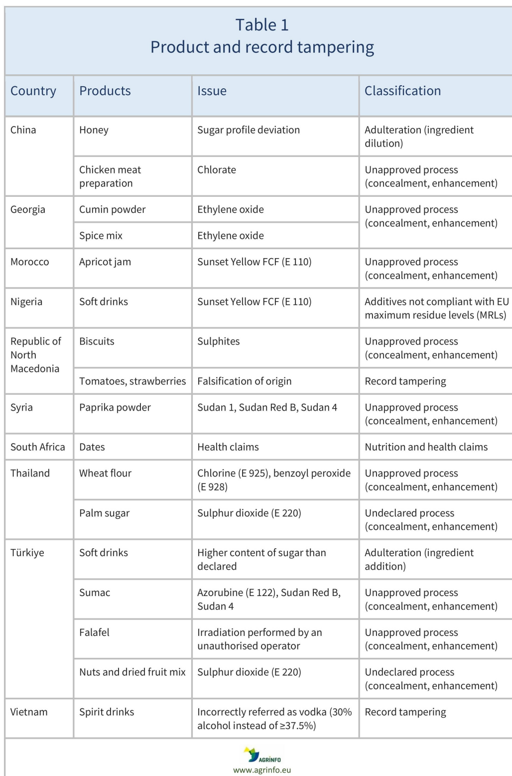
Table & Figures